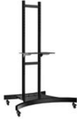
DS-MH1602 Moving Bracket Assembly