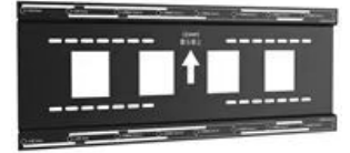
DS-MH1902 Wall Mounted Bracket, Main Bracket (3-4)