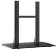
DS-MH1601 Desktop Bracket Assembly