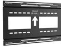
DS-MH1901 Wall Mounted Bracket, Main Bracket (1-2)